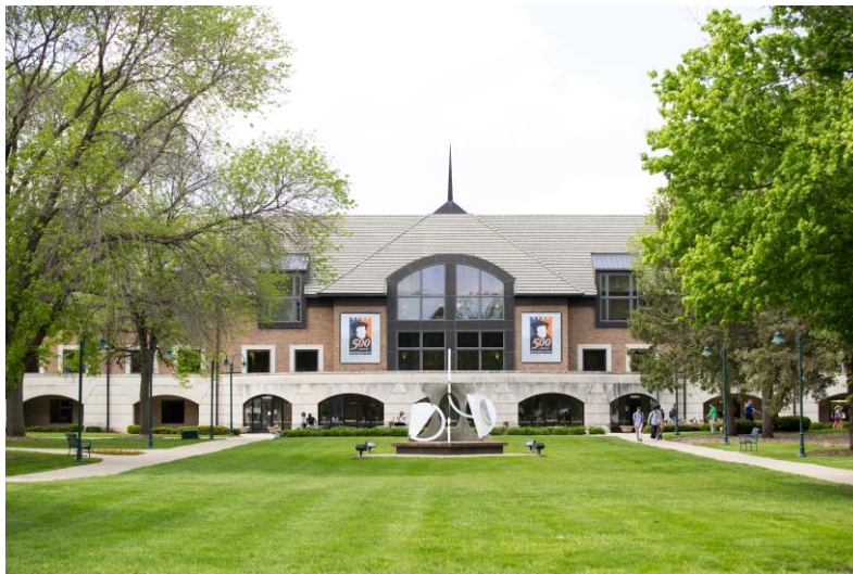
Exterior, Vogel Library

For lodging options in Waverly and the surrounding area, please check here .